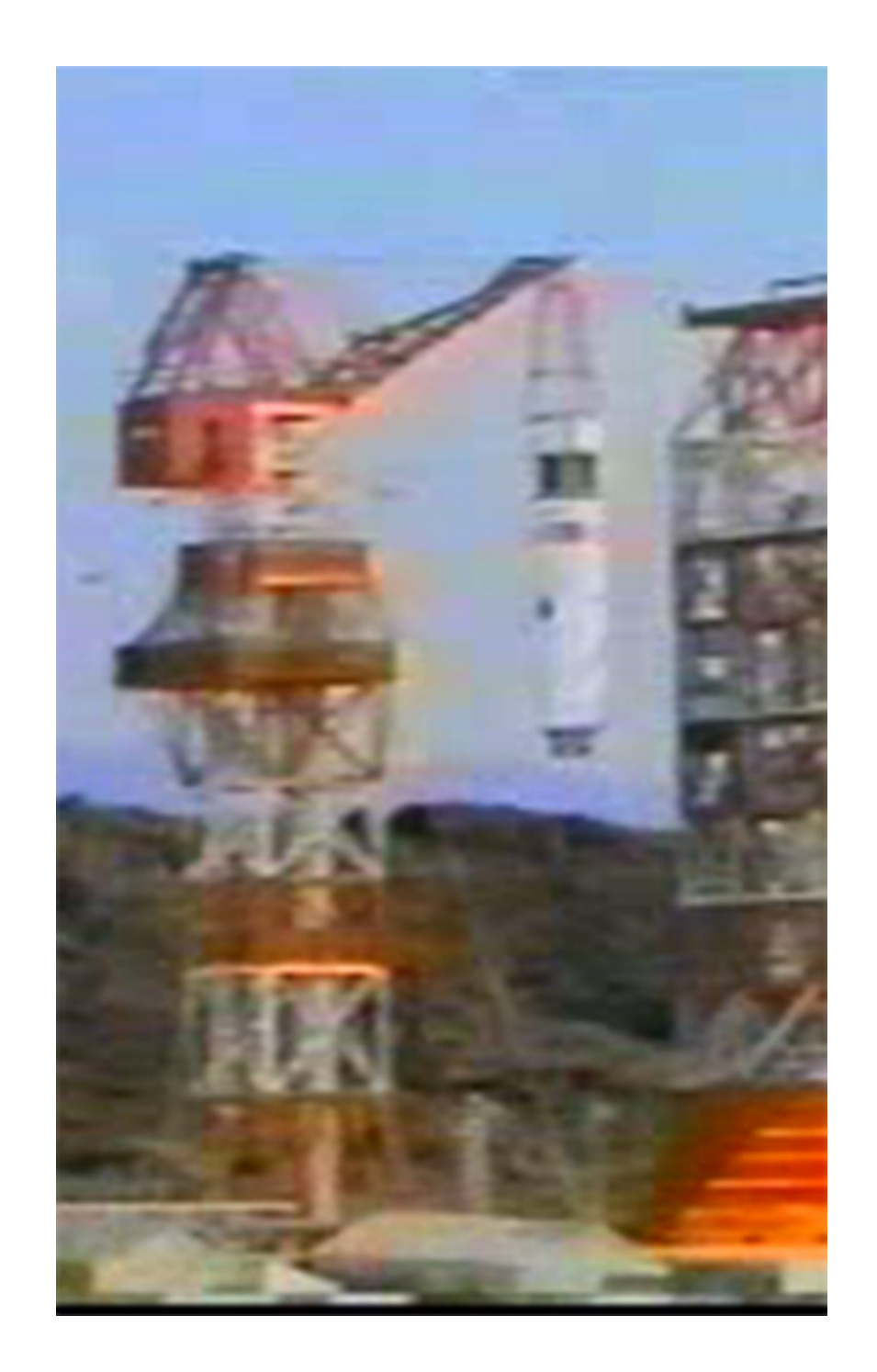
Soft and fuzzy.